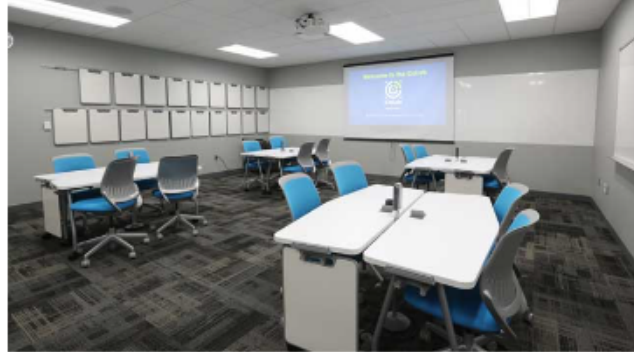
Learning Studio (OCB 107)