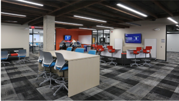
CoLab Commons (OCB 100)

According to the college website, “The CoLab is a hi-tech and flexible space created to encourage students, faculty, staff and community members to innovate, share their knowledge, team and dream.” The CoLab spaces are structured to nurture interdisciplinary collaboration in an environment that is often project-based. Some of the spaces include: