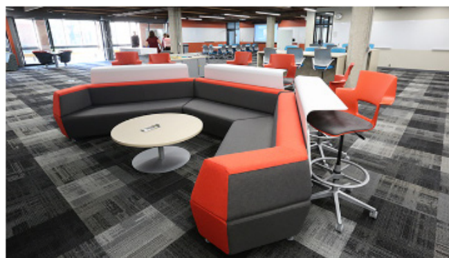
CoLab Couch (CLC)