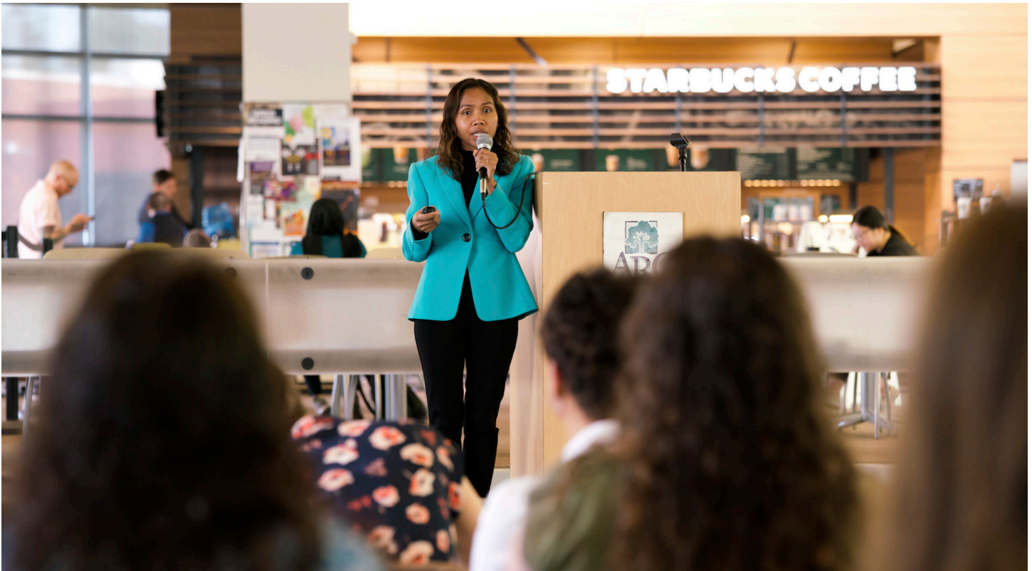
Photo Credit: TJ Ushing (ARC 2nd Annual Symposium on Research to Practice: Addressing Inequities in Higher Education)