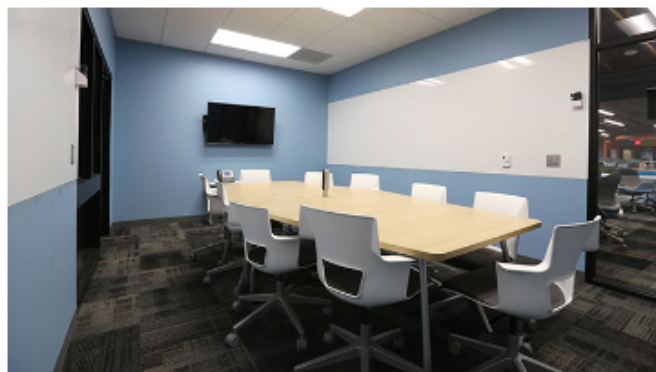
Big 10 Conference Room (OCB 102)