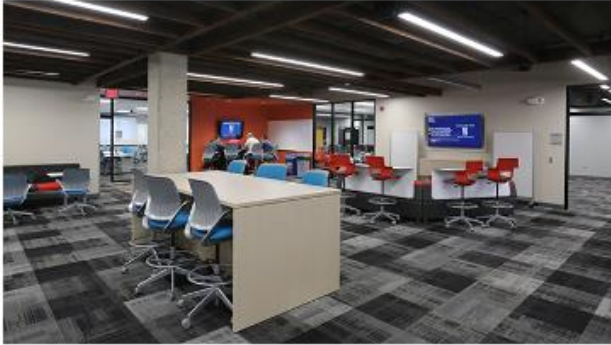
CoLab Commons (OCB 100)

According to the college website, “The CoLab is a hi-tech and flexible space created to encourage students, faculty, staff and community members to innovate, share their knowledge, team and dream.” The CoLab spaces are structured to nurture interdisciplinary collaboration in an environment that is often project-based. Some of the spaces include: