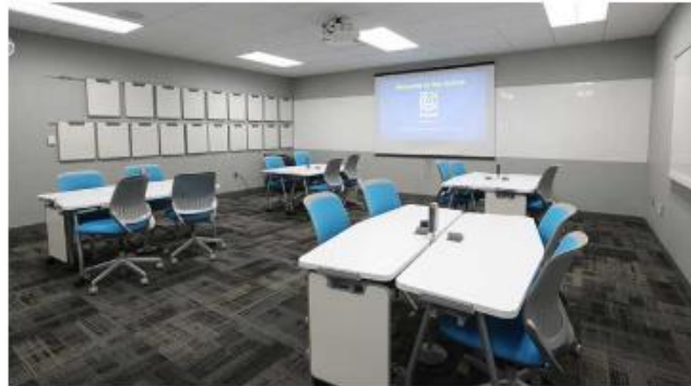
Learning Studio (OCB 107)