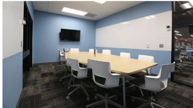
Big 10 Conference Room (OCB 102)