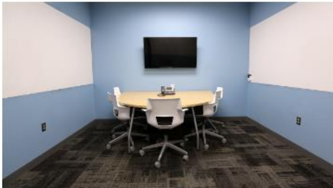
Little 5 Small Conference Room (OCB 104)