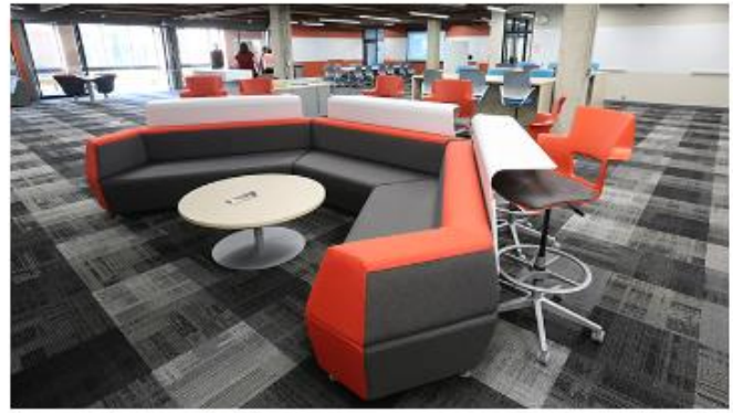
CoLab Couch (CLC)