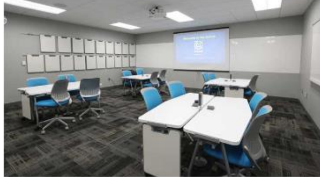
Learning Studio (OCB 107)