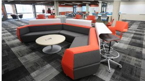
CoLab Couch (CLC)