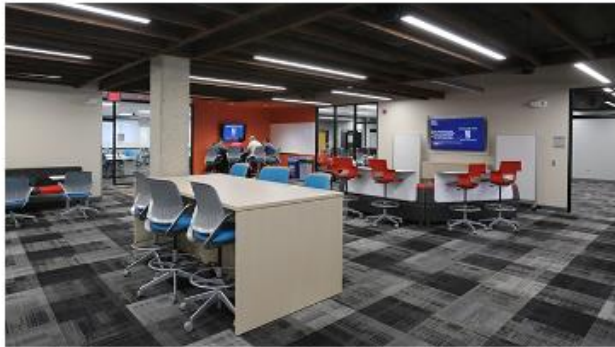
CoLab Commons (OCB 100)

According to the college website, “The CoLab is a hi-tech and flexible space created to encourage students, faculty, staff and community members to innovate, share their knowledge, team and dream.” The CoLab spaces are structured to nurture interdisciplinary collaboration in an environment that is often project-based. Some of the spaces include: