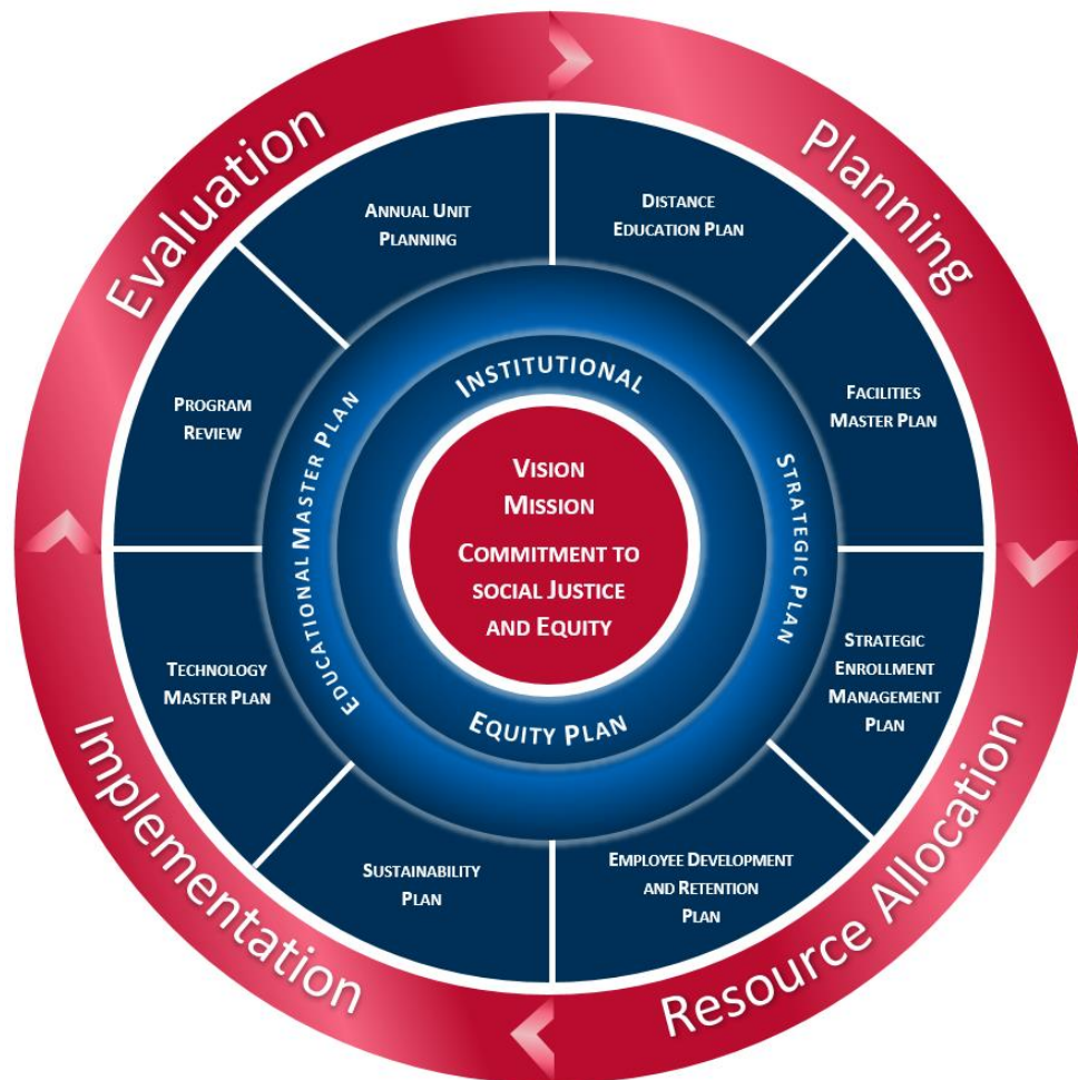
Figure 1: Overview of ARC Integrated Planning Model

All components of the integrated planning process, including the Institutional Equity Plan, are centered on the institution's vision, mission, and commitment to social justice and equity (see Figure 1).