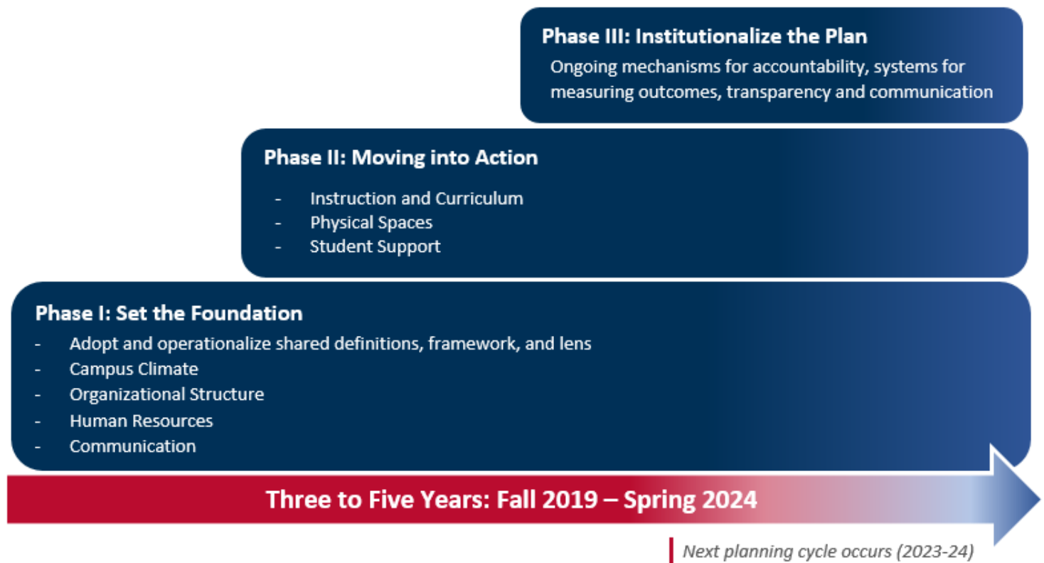
Figure 2: Proposed Phased Approach

While the Institutional Equity Plan is a comprehensive document, it is suggested that it be realized through three phases. These phases should not be viewed as sequential; however, it would be prudent for parts of Phase I to be in process prior to moving into certain actions in subsequent phases. For example, the Equity Framework should be established before developing specific initiatives focused on student support. The diagram below depicts the proposed approach to implementing the recommendations based solely on the project team's planning perspective. It is recognized that the actual implementation strategy and action steps will be determined by college leadership after adoption of the institutional equity plan.